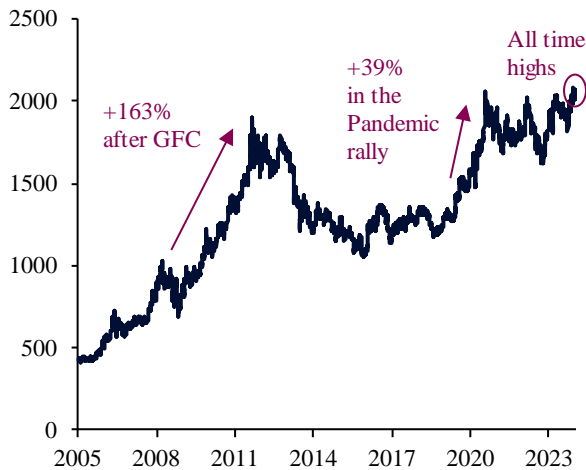
London Gold Bullion (AM fix, USD/Troy oz, 2005-2023)

Sources: Haver, Wall Street Journal, QNB analysis