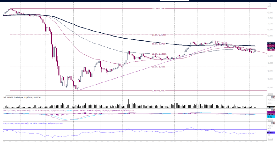
DFM GENERAL INDEX – DAILY CHART