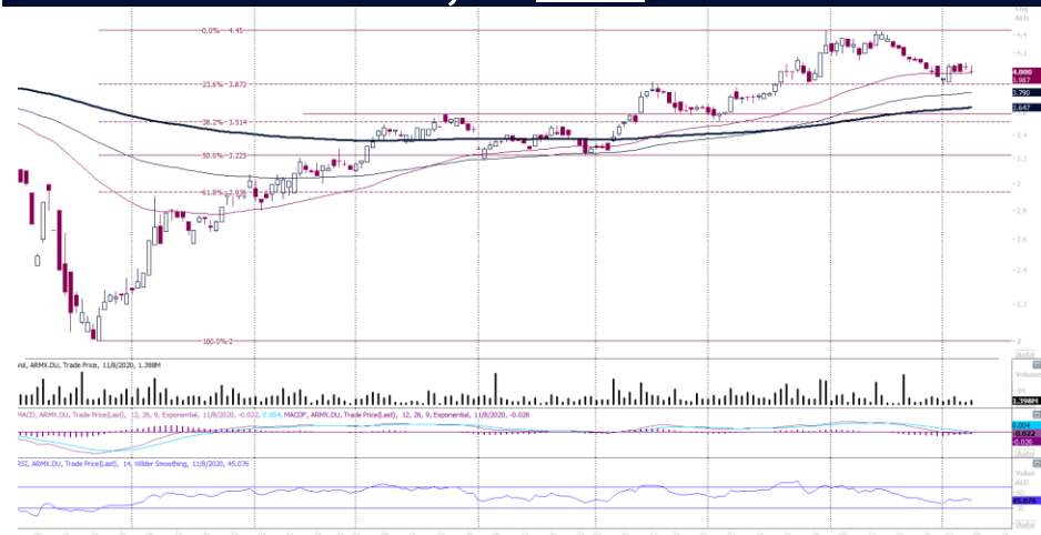
Aramex PJSC – DAILY CHART

The Index is testing its 200 moving average and starting to penetrate below that level. Successful breach means correction is expected on the Index.