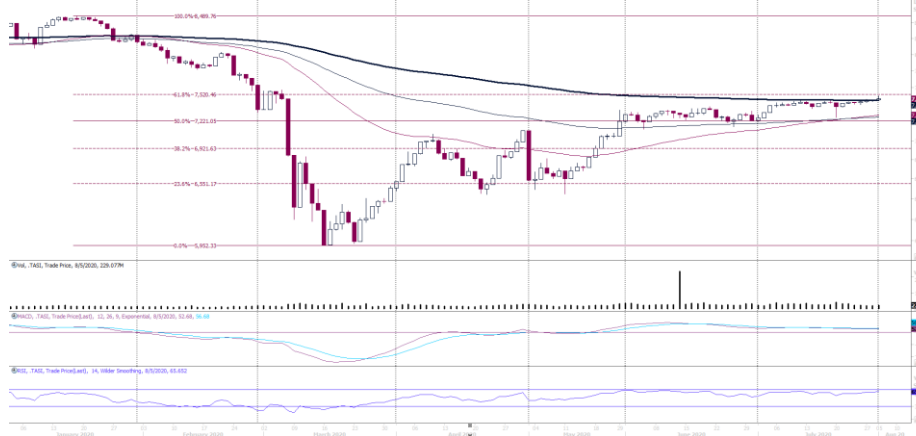
TADAWUL ALL-SHARE INDEX - DAILY CHART