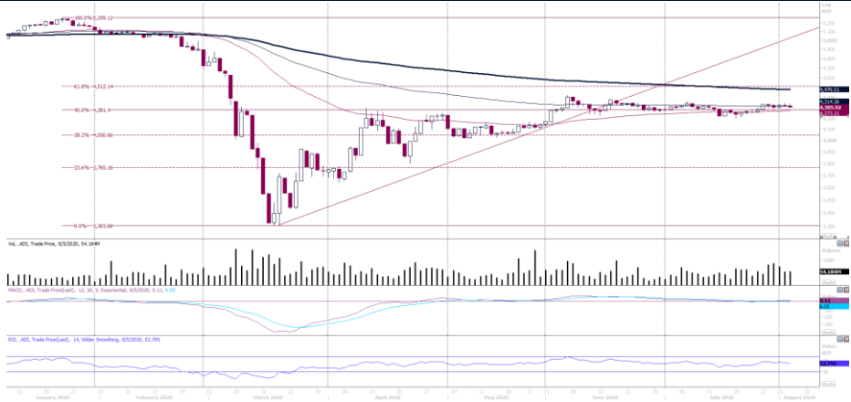
ADX GENERAL INDEX - DAILY CHART