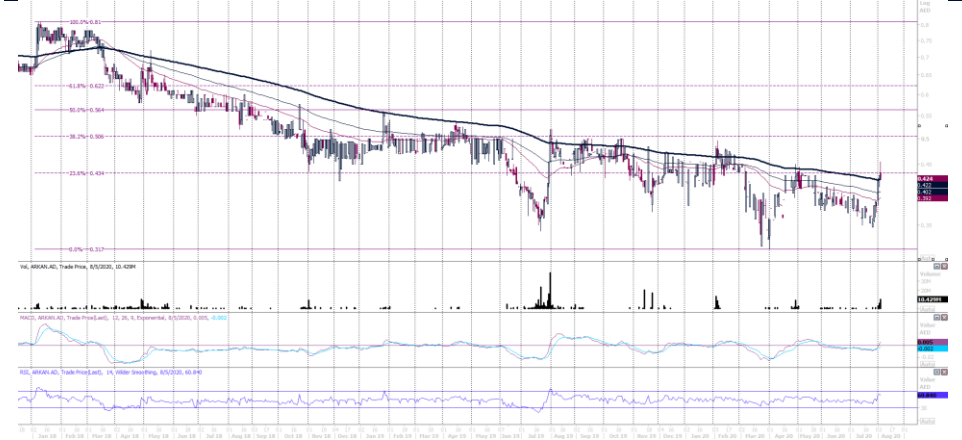
Arkan Building Materials - DAILY CHART

We may see weakness from the current levels as the index stabilized for over a month.