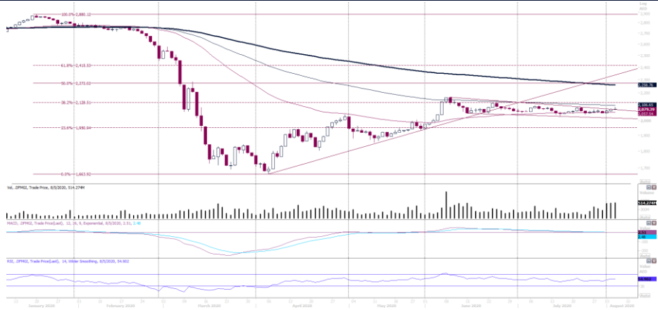
DFM GENERAL INDEX – DAILY CHART