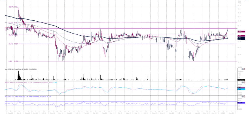
Dar Al Takaful – DAILY CHART

The recent stability below the 200 moving average and the decreasing volumes indicate weakness to unfold.