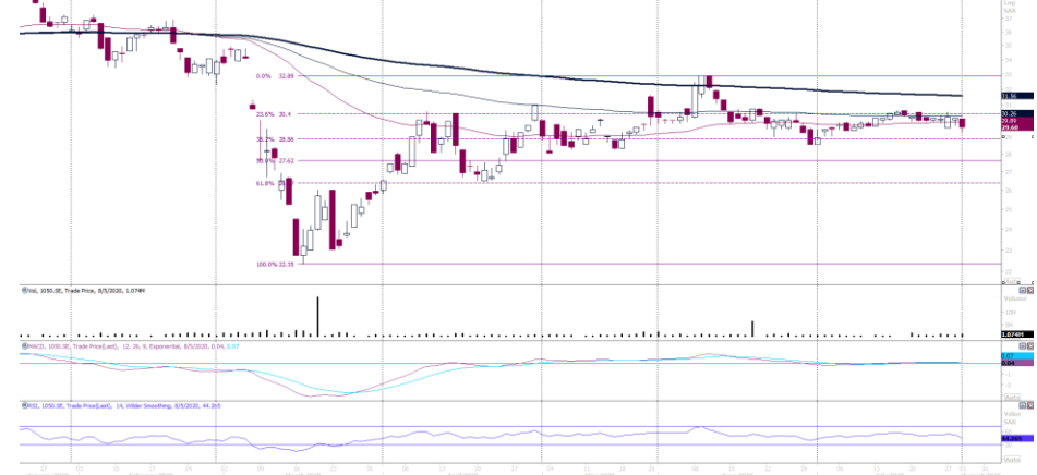
Banque Saudi Fransi - DAILY CHART

Indicators, and recent index movement shows weakness is expected to take place after the recent rally since last March.