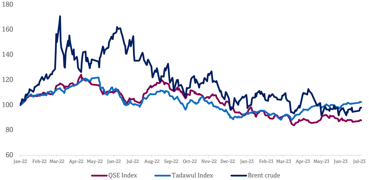
QSE Price Performance Vs. Brent and KSA [Rebased to 100]