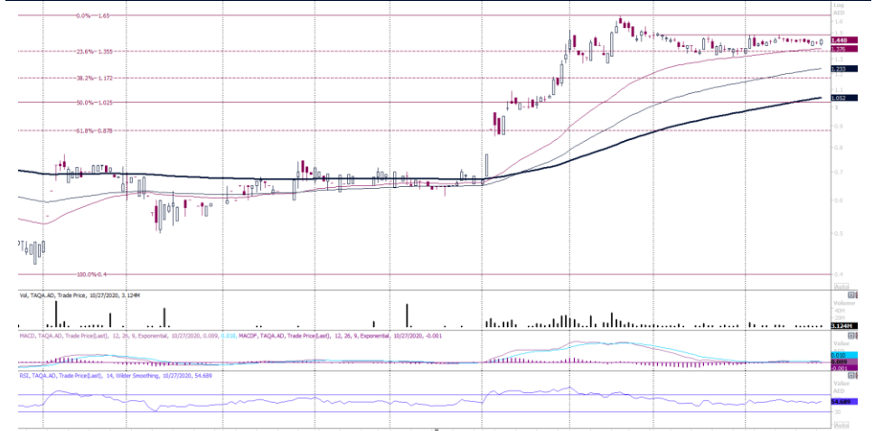
TAQA – DAILY CHART

The Index has managed to move above the ranging box it has been printing inside, which means the Index is headed towards the 4,600 level.