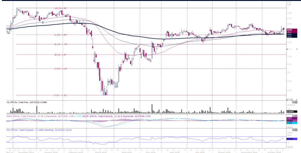
Dubai Financial Market – DAILY CHART

The Index is testing its 200 moving average and starting to penetrate below that level. Successful breach means correction is expected on the Index.