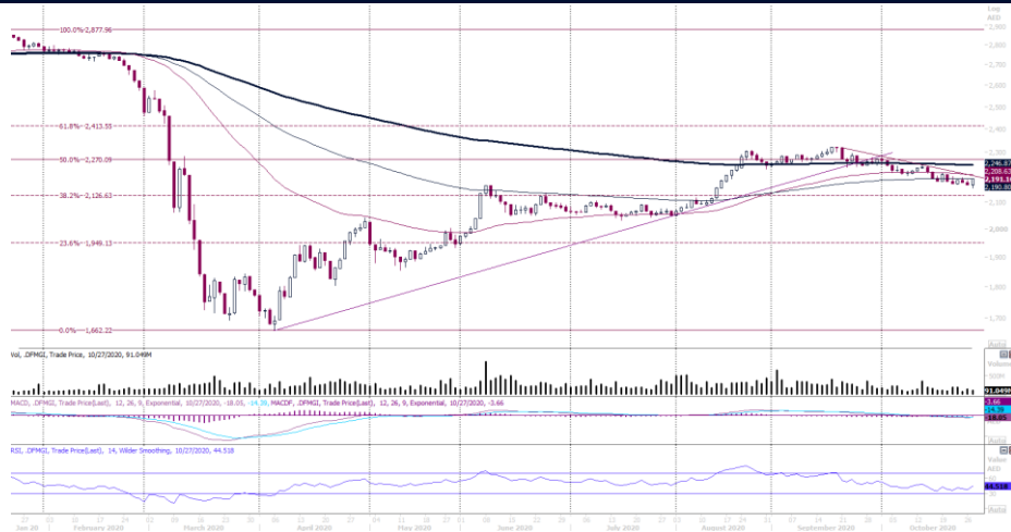
DFM GENERAL INDEX – DAILY CHART