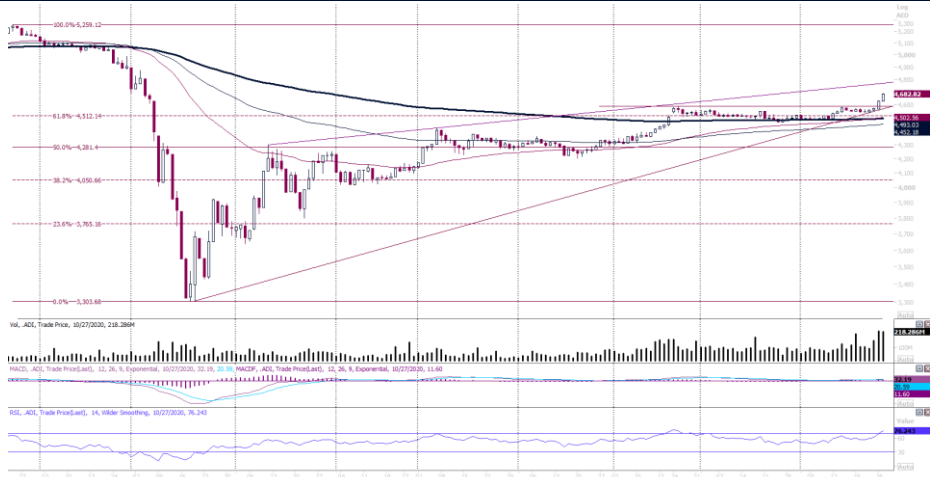
ADX GENERAL INDEX – DAILY CHART